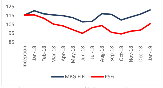
*Rescaled to 115.46 on 8 January 2018 (NAV of fund at inception date)